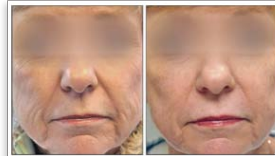
4 Weeks Post 1 Treatment