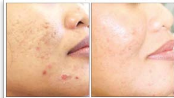
Post 3 Treatments