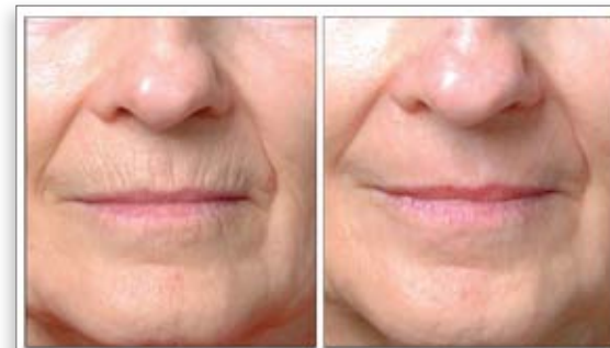
4 Months Post 1 Treatment